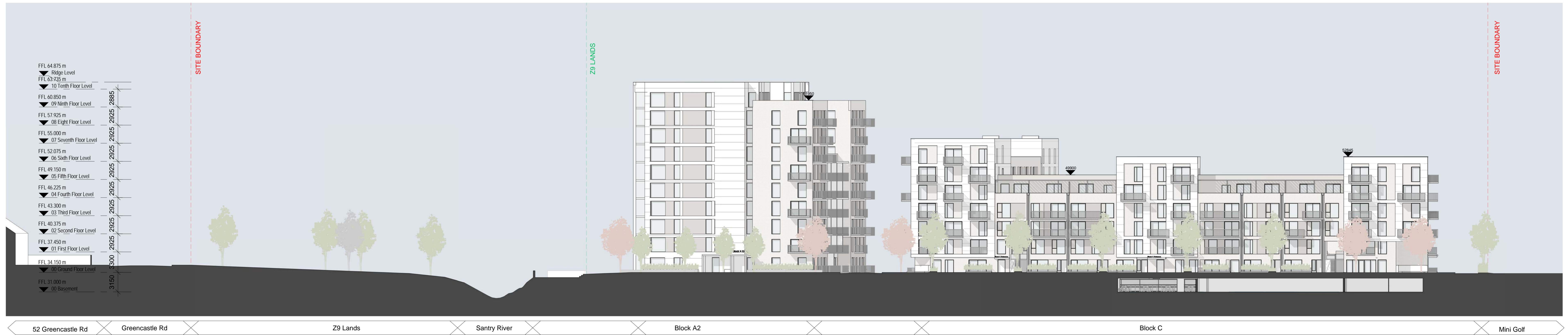
5 Section 5 1 : 250