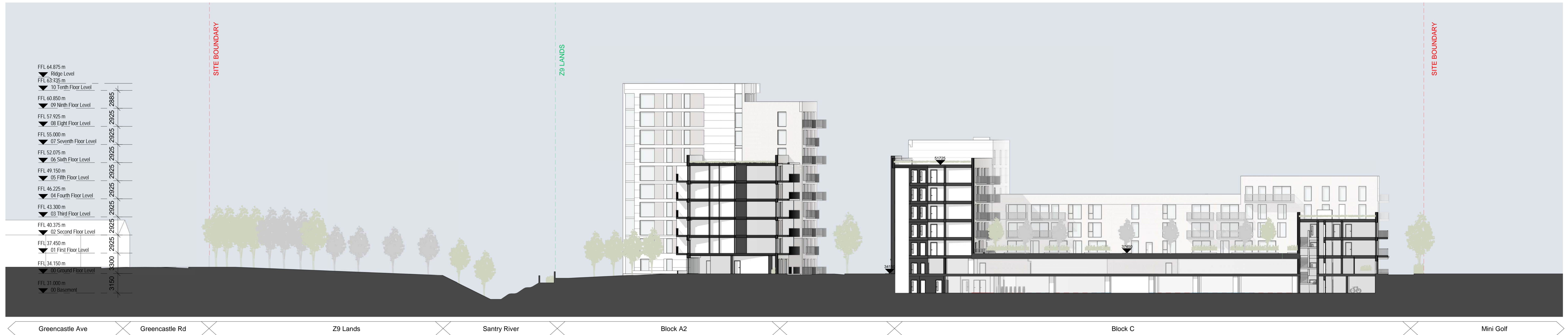
4 Section 4 1 : 250